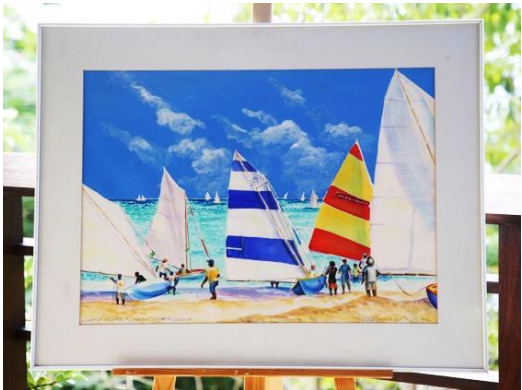
26”H X 34” W (framed) (Click to expand)