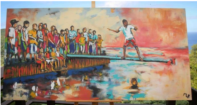
32”H X 72” W (Click to expand)