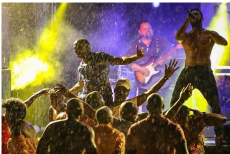
18.5”H x 28” W (with frame) (Click to expand)

On a warm, tropical night at the 2019 Bequia Music Fest, Trinidad’s headliners Imij & Company had the crowd totally pumped up when torrential rain erupted out of nowhere, drenching everyone in sight. Undaunted, the band played on not missing a single beat, while the crowd went wild with delight, reveling in the music, the rain and the madness of the moment. Nicola’s photograph brilliantly captures the essence of that extraordinary night.