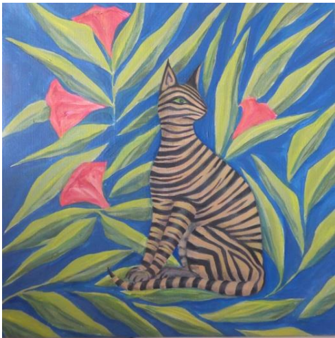
26”H x 26”W ( Click to expand )