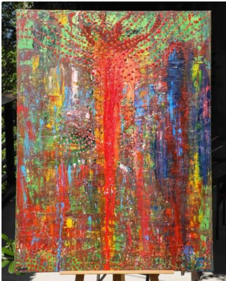
48”H x 36” W (Click to expand)

“Jungle Vision” is one of Chinnery’s larger and more ambitious works. The vibrant, fluid colors have impressive depth, as the layers of living jungle fall away into the haunting depths beyond the central flame tree.