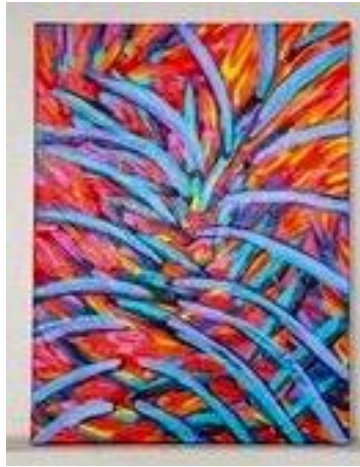
24"H x 18"W ( Click to expand )