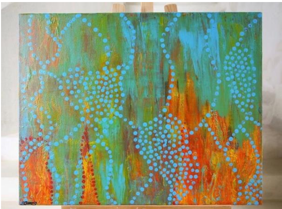
24”H x 30” W ( Click to expand )

Simon Chinnery combines a high-profile job in the City of London with a budding career as an artist with a growing reputation. Creating colorful abstracts in mixed media including acrylic, plant powder and oils, his work is full of energy and movement with inspiration coming from natural landscapes and the amazing worlds that become visible if one looks closely enough. For Simon, “Spirit Guide 3” is Dreamtime – a glow of colors inviting you to follow the dots through a swirling pattern before falling asleep to dream.