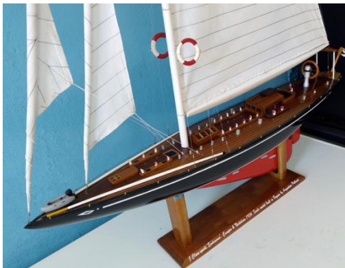
Mast height 46" Length 38" Beam 7.5" (Click either image to expand)