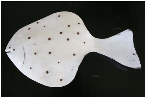
13” H x 20” W ( Click to expand )