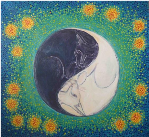
26”H x 26”W ( Click to expand )