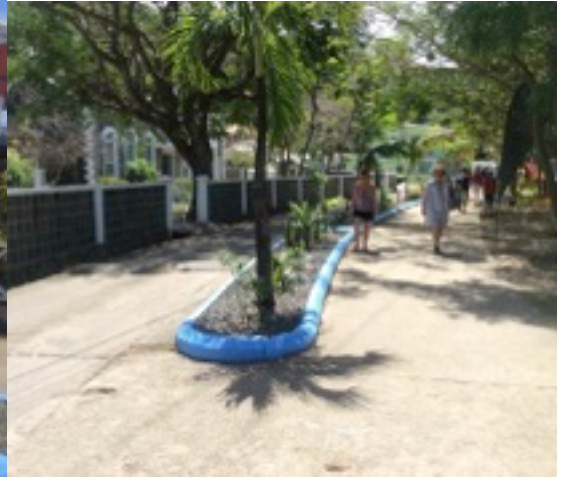
Front Street after it's 'facelift'